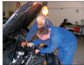
Bentley technical editors working on a 2005 Jetta.